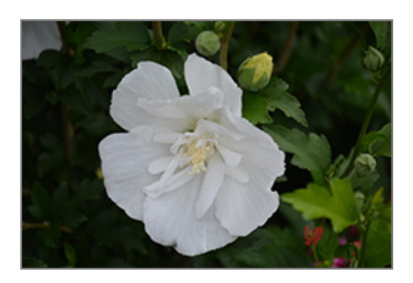
White Pillar Rose of Sharon flowers

White Pillar Rose of Sharon is recommended for the following landscape applications;