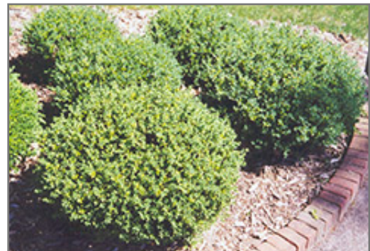
Japanese Boxwood