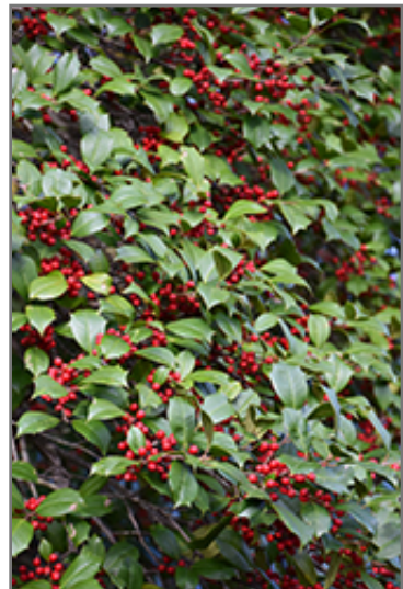
American Holly fruit