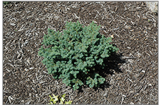
Blue Nest Spruce

Blue Nest Spruce will grow to be about 4 feet tall at maturity, with a spread of 4 feet. It tends to fill out right to the ground and therefore doesn't necessarily require facer plants in front. It grows at a slow rate, and under ideal conditions can be expected to live for 50 years or more.