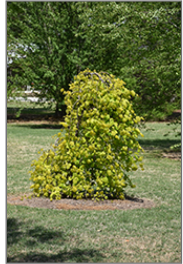
Cascading Hearts Redbud

* This is a 'special order' plant - contact store for details