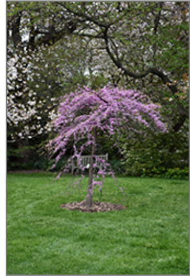
Cascading Hearts Redbud in bloom