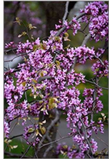
Cascading Hearts Redbud flowers