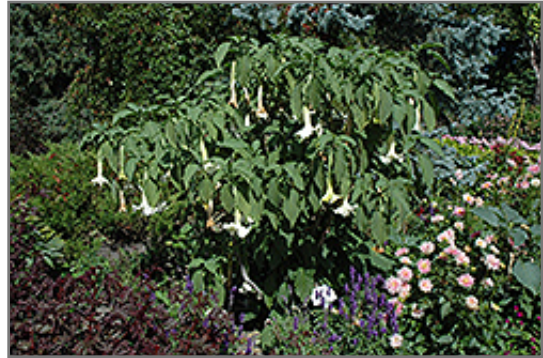
White Angel's Trumpet in bloom