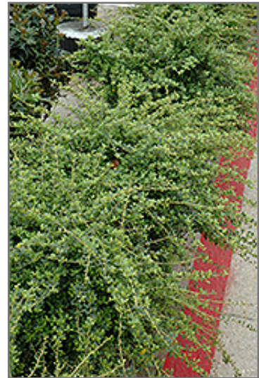
Helleri Japanese Holly

* This is a 'special order' plant - contact store for details