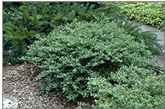
Helleri Japanese Holly