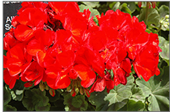
Allure Scarlet Geranium flowers