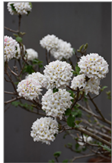
Cayuga Viburnum flowers

This is a relatively low maintenance shrub, and should only be pruned after flowering to avoid removing any of the current season's flowers. It is a good choice for attracting birds to your yard, but is not particularly attractive to deer who tend to leave it alone in favor of tastier treats. It has no significant negative characteristics.