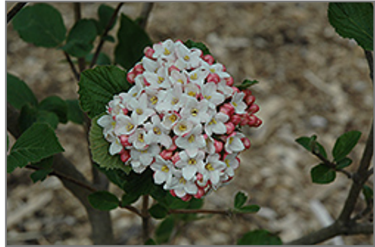
Cayuga Viburnum flowers

This shrub does best in full sun to partial shade. It prefers to grow in average to moist conditions, and shouldn't be allowed to dry out. It is not particular as to soil type or pH. It is somewhat tolerant of urban pollution. This particular variety is an interspecific hybrid.