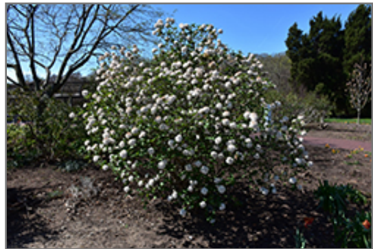
Cayuga Viburnum in bloom