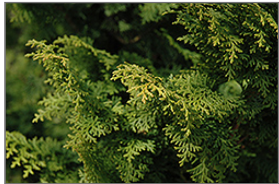
Graciosa Hinoki Falsecypress foliage