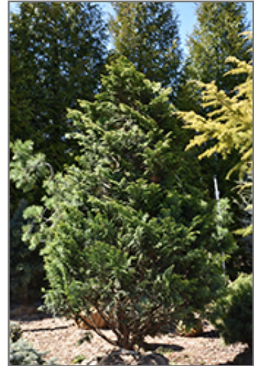
Graciosa Hinoki Falsecypress

Graciosa Hinoki Falsecypress is recommended for the following landscape applications;