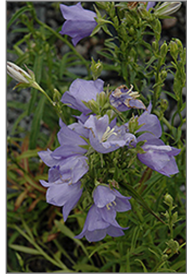
Telham Beauty Peachleaf Bellflower flowers