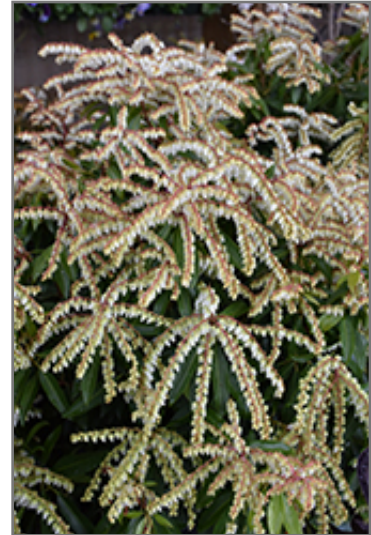
Brouwer's Beauty Japanese Pieris flowers