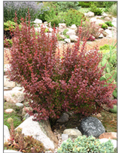
Orange Rocket Japanese Barberry

This shrub does best in full sun to partial shade. It is very adaptable to both dry and moist growing conditions, but will not tolerate any standing water. It is considered to be drought-tolerant, and thus makes an ideal choice for xeriscaping or the moisture-conserving landscape. It is not particular as to soil type or pH, and is able to handle environmental salt. It is highly tolerant of urban pollution and will even thrive in inner city environments. This is a selected variety of a species not originally from North America.