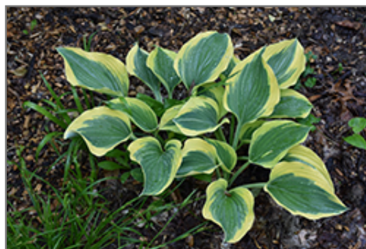
Liberty Hosta