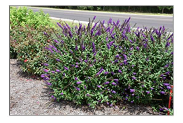
Miss Violet Butterfly Bush in bloom