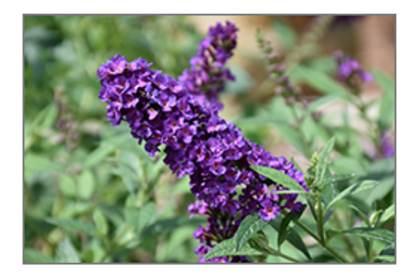
Miss Violet Butterfly Bush flowers

Miss Violet Butterfly Bush is recommended for the following landscape applications;