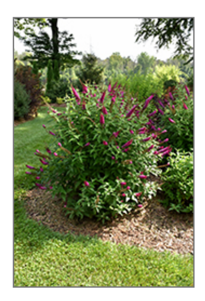
Miss Molly Butterfly Bush in bloom