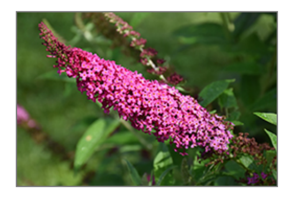
Miss Molly Butterfly Bush flowers

Miss Molly Butterfly Bush is recommended for the following landscape applications;