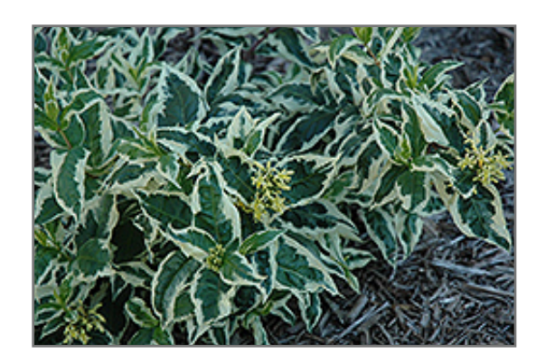
Cool Splash Bush Honeysuckle flowers

Cool Splash Bush Honeysuckle is a dense multi-stemmed deciduous shrub with a shapely form and gracefully arching branches. Its average texture blends into the landscape, but can be balanced by one or two finer or coarser trees or shrubs for an effective composition.