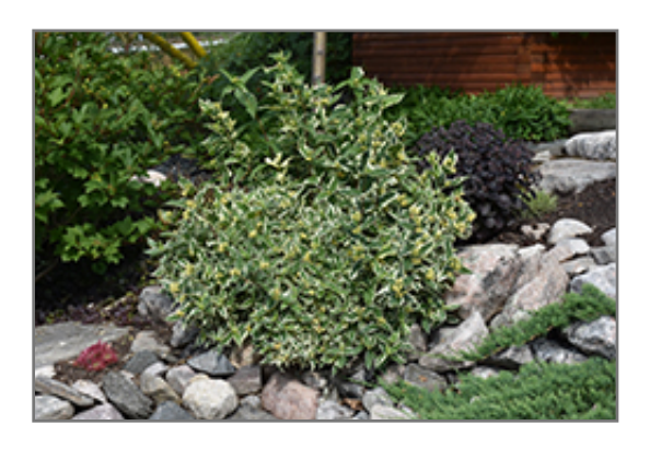
Cool Splash Bush Honeysuckle