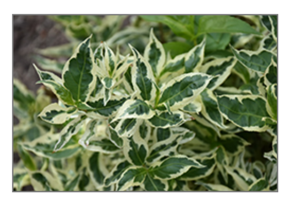
Cool Splash Bush Honeysuckle foliage