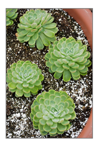
Mexican Snowball

This variety is very drought tolerant, producing ball shaped rosettes of foliage that is powdery blue-gray with pinkish edges; distinctive pink flowers with yellow tips on tall bracts in summer; excellent accent plant for bright indoor areas