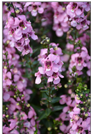
Serenita Pink Angelonia flowers