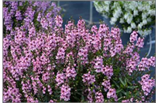
Serenita Pink Angelonia in bloom