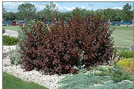
Diablo Ninebark