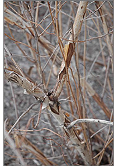
Diablo Ninebark bark

This shrub does best in full sun to partial shade. It is very adaptable to both dry and moist locations, and should do just fine under average home landscape conditions. It is not particular as to soil type or pH. It is highly tolerant of urban pollution and will even thrive in inner city environments. This is a selection of a native North American species.