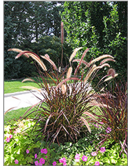
Purple Fountain Grass flowers

Purple Fountain Grass is recommended for the following landscape applications;