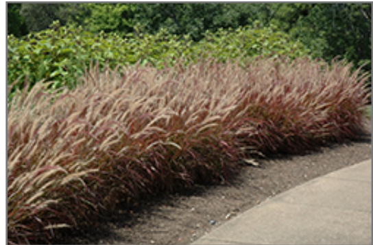
Purple Fountain Grass in bloom

Purple Fountain Grass will grow to be about 4 feet tall at maturity, with a spread of 3 feet. Although it's not a true annual, this plant can be expected to behave as an annual in our climate if left outdoors over the winter, usually needing replacement the following year. As such, gardeners should take into consideration that it will perform differently than it would in its native habitat.