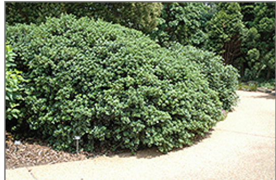
Roundleaf False Holly