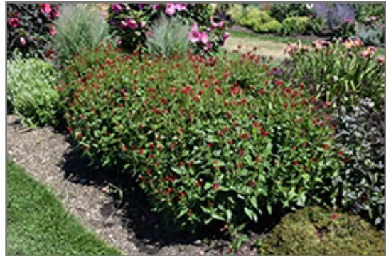
Little Redhead Indian Pink in bloom