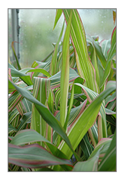
Field Of Dreams Ornamental Corn foliage

Field Of Dreams Ornamental Corn will grow to be about 5 feet tall at maturity, with a spread of 24 inches. When grown in masses or used as a bedding plant, individual plants should be spaced approximately 18 inches apart. It tends to be leggy, with a typical clearance of 2 feet from the ground, and should be underplanted with lower-growing perennials. This fast-growing annual will normally live for one full growing season, needing replacement the following year.