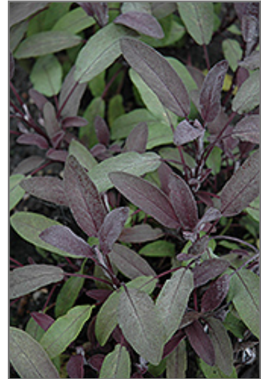
Purple Sage foliage

Aside from its primary use as an edible, Purple Sage is suitable for the following landscape applications;