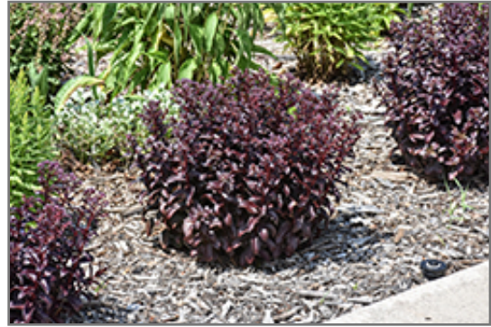
Dark Magic Stonecrop in bloom

Dark Magic Stonecrop will grow to be about 12 inches tall at maturity, with a spread of 20 inches. When grown in masses or used as a bedding plant, individual plants should be spaced approximately 16 inches apart. It grows at a fast rate, and under ideal conditions can be expected to live for approximately 15 years. As an herbaceous perennial, this plant will usually die back to the crown each winter, and will regrow from the base each spring. Be careful not to disturb the crown in late winter when it may not be readily seen!