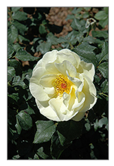
High Voltage Rose flowers