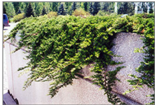
Prince of Wales Juniper