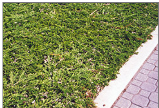
Prince of Wales Juniper