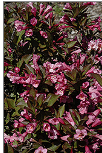
Samba Weigela flowers

Samba Weigela will grow to be about 3 feet tall at maturity, with a spread of 3 feet. It has a low canopy. It grows at a medium rate, and under ideal conditions can be expected to live for approximately 30 years.