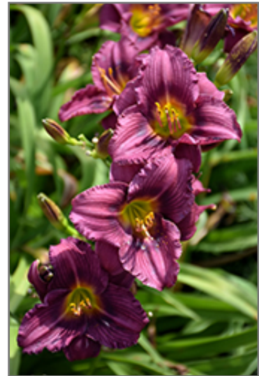
Little Grapette Daylily flowers

Little Grapette Daylily will grow to be about 12 inches tall at maturity extending to 16 inches tall with the flowers, with a spread of 18 inches. When grown in masses or used as a bedding plant, individual plants should be spaced approximately 14 inches apart. Its foliage tends to remain dense right to the ground, not requiring facer plants in front. It grows at a medium rate, and under ideal conditions can be expected to live for approximately 10 years. As an herbaceous perennial, this plant will usually die back to the crown each winter, and will regrow from the base each spring. Be careful not to disturb the crown in late winter when it may not be readily seen!