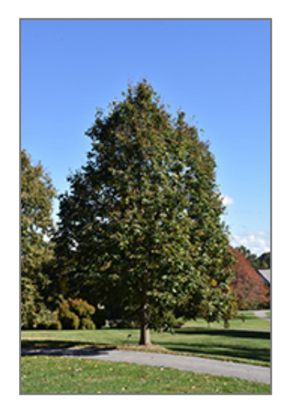
Redmond Linden