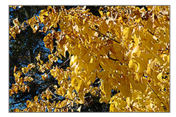
Redmond Linden in fall