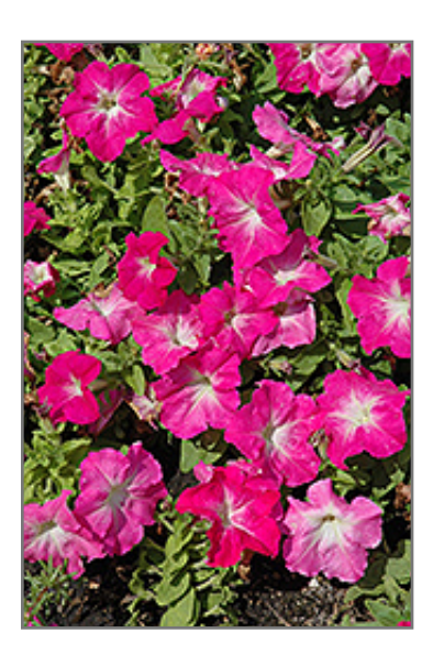
Limbo GP Rose Morn Petunia flowers

Limbo GP Rose Morn Petunia will grow to be about 8 inches tall at maturity, with a spread of 12 inches. When grown in masses or used as a bedding plant, individual plants should be spaced approximately 10 inches apart. Its foliage tends to remain low and dense right to the ground. This fast-growing annual will normally live for one full growing season, needing replacement the following year.