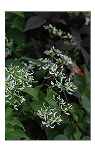
Euphoric White Euphorbia flowers

Euphoric White Euphorbia will grow to be about 12 inches tall at maturity, with a spread of 18 inches. When grown in masses or used as a bedding plant, individual plants should be spaced approximately 14 inches apart. Its foliage tends to remain dense right to the ground, not requiring facer plants in front. This fast-growing annual will normally live for one full growing season, needing replacement the following year.