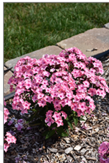
Sweet Summer Queen Garden Phlox in bloom