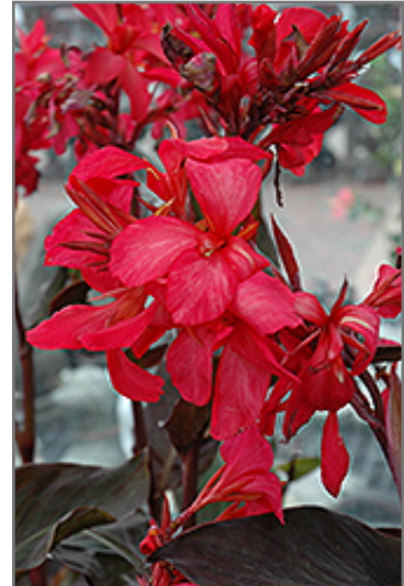
Australia Canna flowers