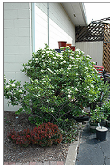
Winterthur Viburnum in bloom