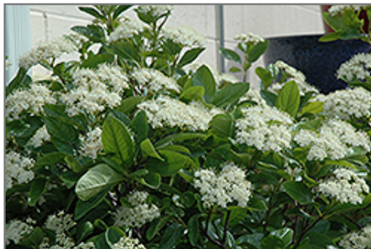
Winterthur Viburnum flowers

Winterthur Viburnum is a dense multi-stemmed deciduous shrub with an upright spreading habit of growth. Its average texture blends into the landscape, but can be balanced by one or two finer or coarser trees or shrubs for an effective composition.