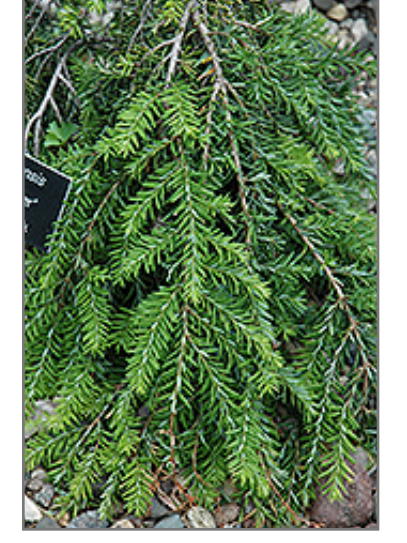
Ashfield Weeper Hemlock foliage

10,000 Great Plains Blvd. Chaska, MN 55318 952-445-6555 www.TheMustardSeedInc.com contactus@themustardseedinc.com ...the birds of the air can perch in its shade. Mark 4:30-32