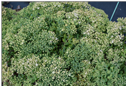
Thundercloud Stonecrop flower buds