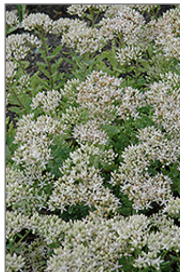
Thundercloud Stonecrop flowers

Thundercloud Stonecrop is a dense herbaceous perennial with a mounded form. Its relatively fine texture sets it apart from other garden plants with less refined foliage.