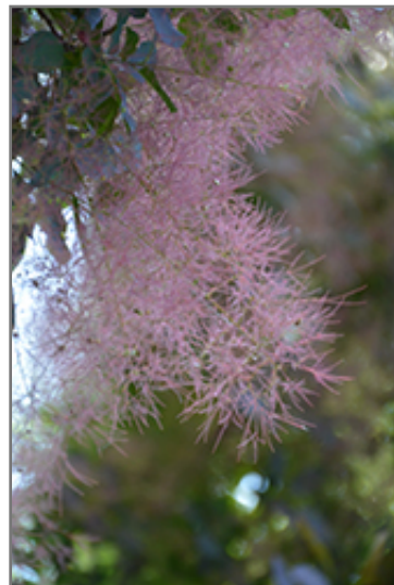
Royal Purple Smokebush flowers

This shrub should only be grown in full sunlight. It is very adaptable to both dry and moist locations, and should do just fine under average home landscape conditions. It is not particular as to soil type or pH. It is highly tolerant of urban pollution and will even thrive in inner city environments, and will benefit from being planted in a relatively sheltered location. This is a selected variety of a species not originally from North America.