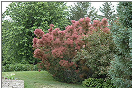
Royal Purple Smokebush in bloom

This shrub will require occasional maintenance and upkeep, and is best pruned in late winter once the threat of extreme cold has passed. Deer don't particularly care for this plant and will usually leave it alone in favor of tastier treats. It has no significant negative characteristics.