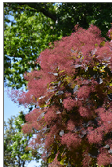
Grace Smokebush flowers