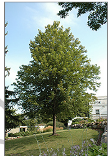
Celebration Maple