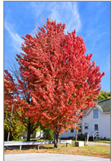
Celebration Maple in fall