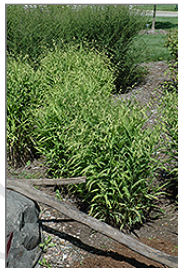
Northern Sea Oats