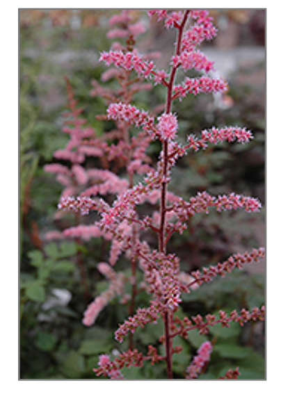
Color Flash Astilbe flowers

Striking light -pink colored plumes rising above glossy leaves that start out chartreuse and turn bronze for the summer; perfect in a shady spot with dappled light; prefers moisture so water regularly for abundant flowers and nice foliage