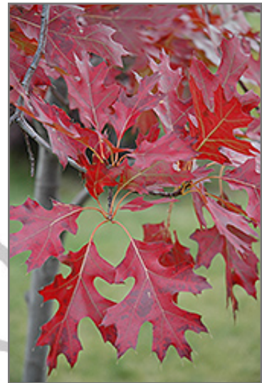
Northern Pin Oak in fall