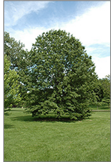
Northern Pin Oak

Northern Pin Oak is recommended for the following landscape applications;