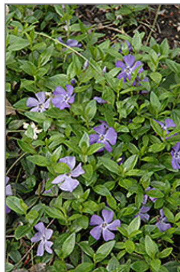
Common Periwinkle in bloom

Common Periwinkle is recommended for the following landscape applications;