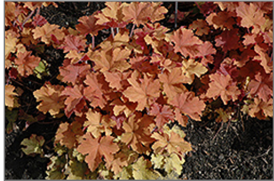
Caramel Coral Bells foliage

This is a relatively low maintenance plant, and should be cut back in late fall in preparation for winter. It is a good choice for attracting hummingbirds to your yard. It has no significant negative characteristics.