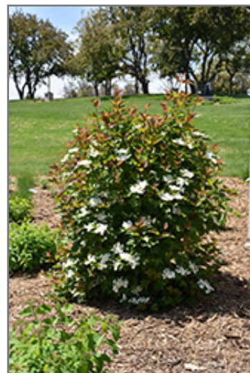
Redwing Highbush Cranberry in bloom