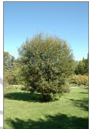
Pussy Willow