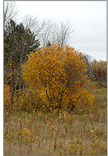
Pussy Willow in fall

This shrub does best in full sun to partial shade. It is quite adaptable, preferring to grow in average to wet conditions, and will even tolerate some standing water. It is not particular as to soil type or pH. It is somewhat tolerant of urban pollution. This species is native to parts of North America.