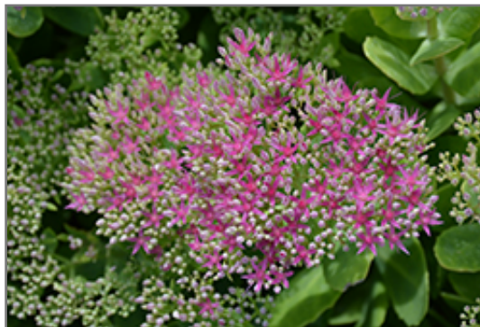
Neon Stonecrop flower buds