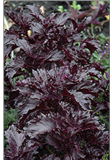
Purple Ruffles Basil foliage

Purple Ruffles Basil is a good choice for the edible garden, but it is also well-suited for use in outdoor pots and containers. It is often used as a 'filler' in the 'spiller-thriller-filler' container combination, providing a canvas of foliage against which the larger thriller plants stand out. Note that when growing plants in outdoor containers and baskets, they may require more frequent waterings than they would in the yard or garden.